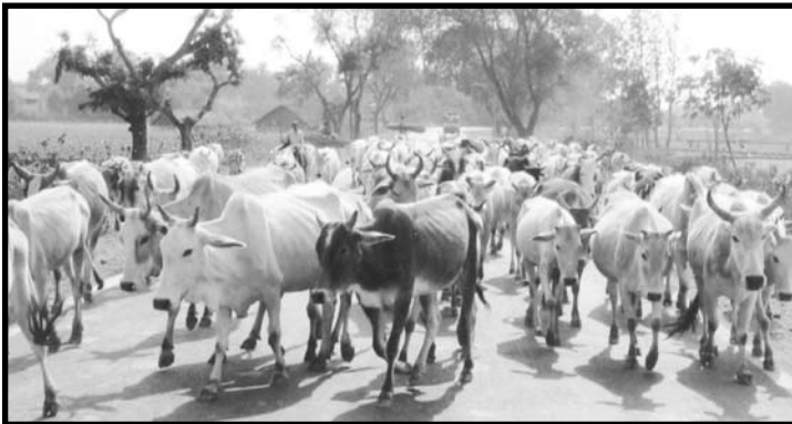
One of the familiar sights on the highways.