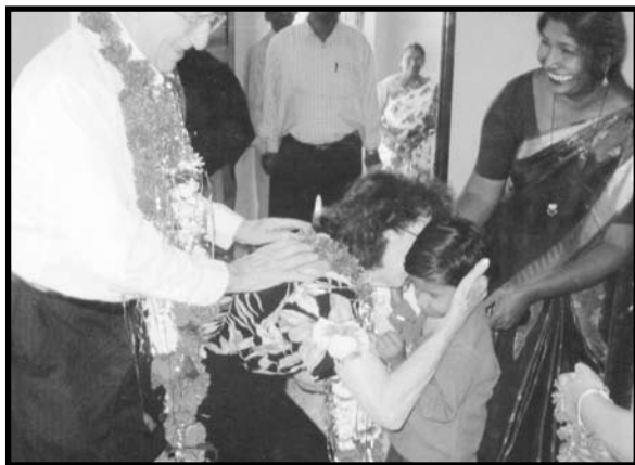
Miranda hugging one of the blind children.