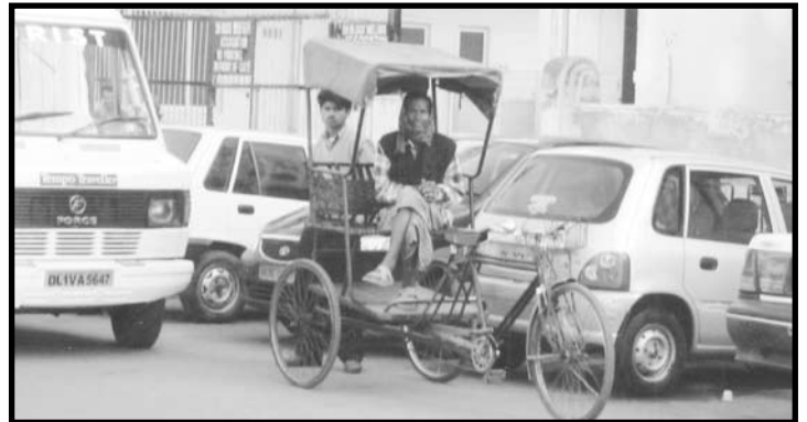
Rickshaw bicycles, a regular method of transport.

On our way to Damoh, the village where the mission base is located, we had to pass through the metro city of Jabalpur. Unknown to our driver, a curfew had been declared in this city. The reason being, clashes between Hindus and Muslims had fought a battle two days prior to our arrival. Mobs had been on the streets and there had been casualties.