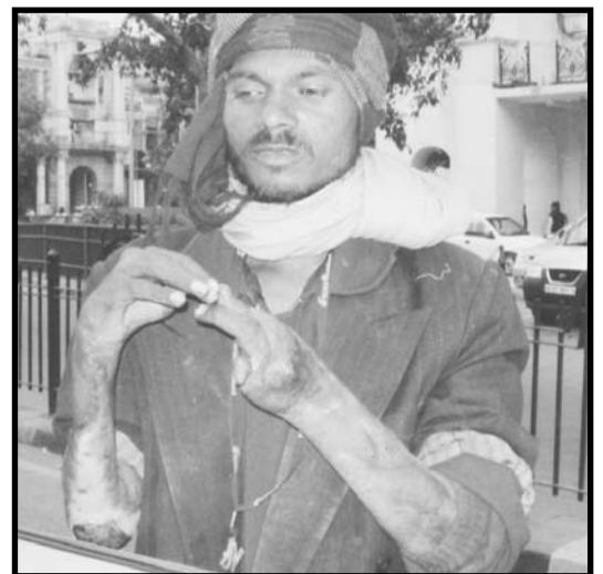
One of the beggars to whom we gave money. Possibly he had leprosy. It was really sad.