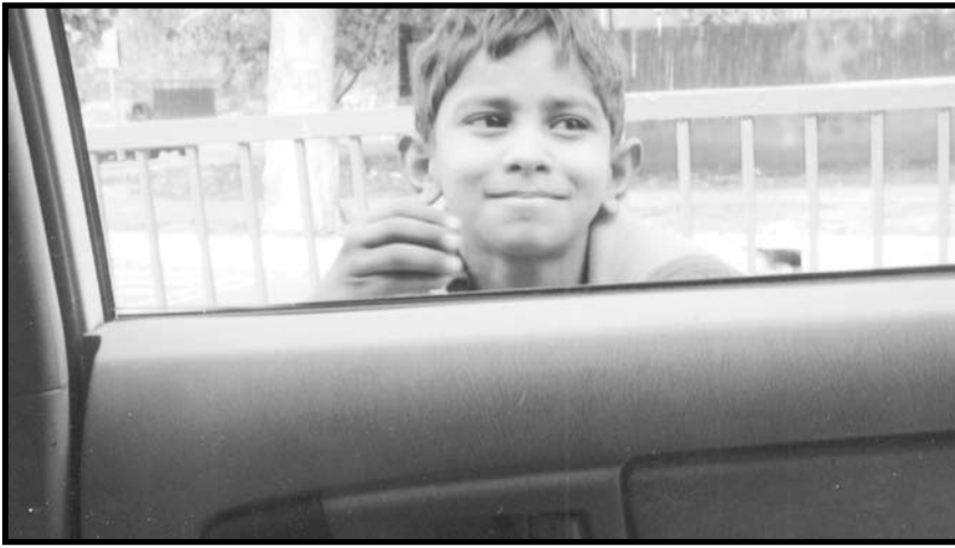
Boy begging at our car window.