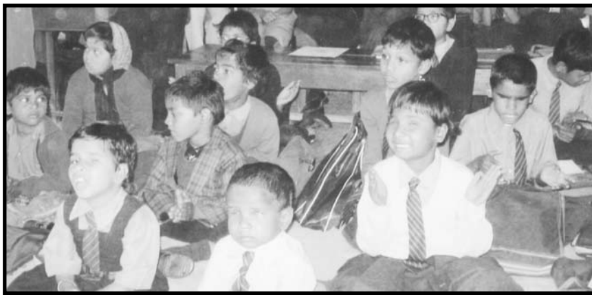
The blind children at the mission. We cried.