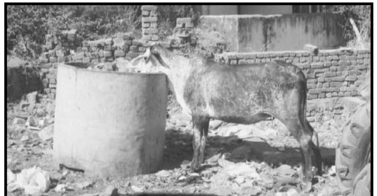
Many cows have little or no grass to eat. This cow was eating out of the trash can.