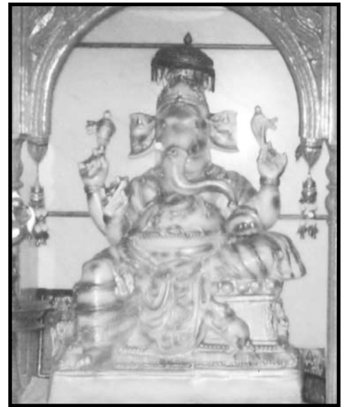
One of the millions of idols. This was at a hotel we stayed.

The following day was the beginning of our 500-mile trip by road and train to the mission. There were two kinds of roads equally divided by length. I named the roads "Heaven-sent" (those are the ones that had asphalt and the others I named "hell-bent" (those were atrocious -- you bumped from the seat to the roof of the car). Driving in India is a nightmare. The traffic is a sight to behold -- dogs, goats, water buffalo, and cows are everywhere on the road. There are oxen and camels pulling carts, bicycles used as rickshaws, motorbikes often with ladies wearing saris sitting side saddle on the back seat. All this along with your regular traffic of cars, buses, and trucks. They drive on the horn and nobody pulls over until the last second. At first my host let me ride on the front seat. At the first stop I requested I set at the back of the car -- my blood pressure couldn't handle it!