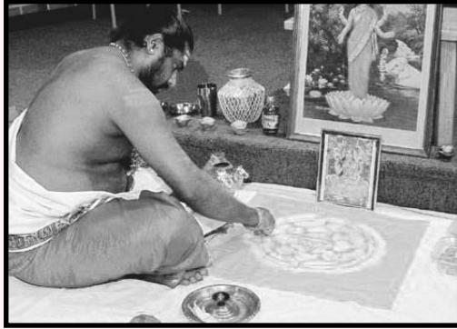
Hindu attending to a shring in the home.