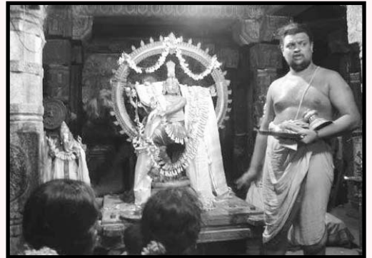
Inside a Hindu temple.

United in darkness: India is an incredibly diverse mosaic of cultures, languages, and philosophies wrought by wave after wave of invasions of the subcontinent over thousands of years. Unfortunately, the one unifying thread for 80% of its population is the poly-theistic Hindu religion.